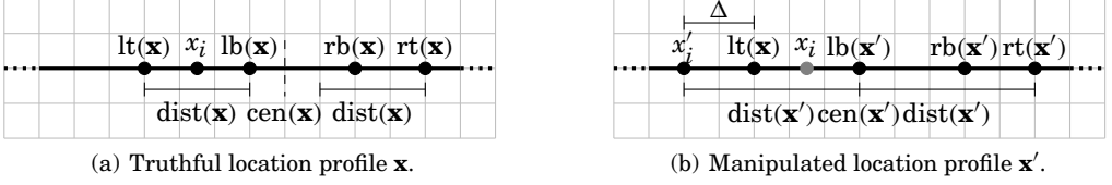
Fig. 2. An illustration of subsubcase 2.1.1 in the proof of Theorem 4.5.

It follows from the observation and from the fact that lt(\mathbf{x}) = lt(\mathbf{x}') (since we are in Case 1.2) that in our current subsubcase,